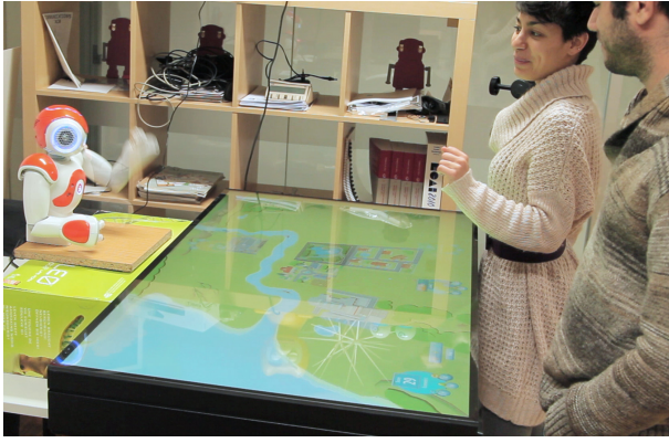
Fig. 2. Robotic tutor playing Energities with students