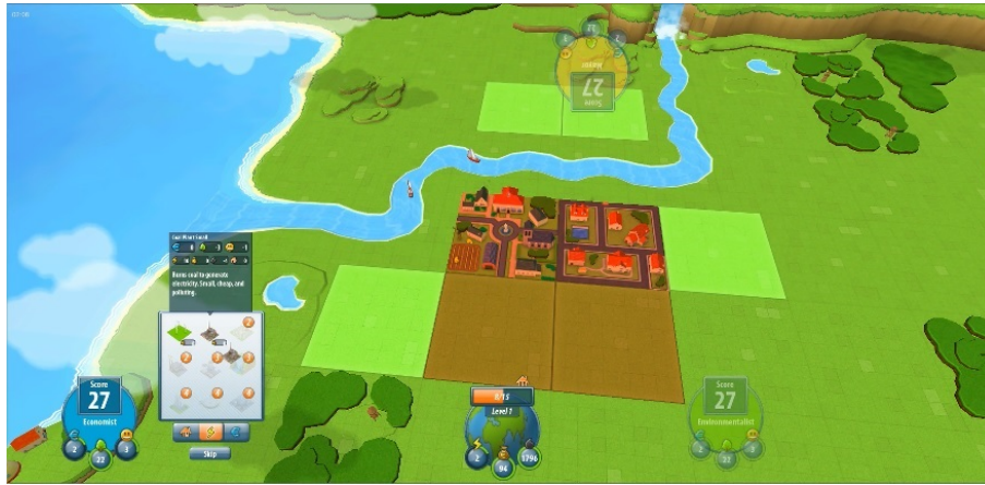
Fig. 1. Screenshot of Energities game

Intelligent Energy Europe and this project reports that this serious game made students aware of energy expenditure, among others [16]. Schools across Europe have already used Energities in their curriculum and this game was therefore chosen as the basis of our collaborative scenario. Within the EMOTE project, the original online single player game was adapted to a multiplayer version where participants interact by using a multi-touch table or a tablet. This was done to stimulate collaborative learning [17], [4].