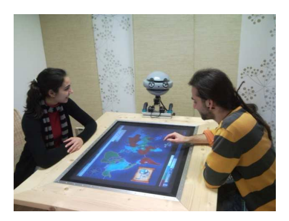
Fig. 1. EMYS at the multi-touch table

Two students, Alice and Brian, are beginning to learn about ecology models. They want to create a model of how acid rain impacts the level of fish in a local stream both in the winter, when it contains a lot of cold water, and in the summer, when its water level is low and much warmer. They find grasping how the various processes affect each other quite difficult and, when completing structured learning activities individually at their computers, they get quickly tired and frustrated. Another option is to work on the activity together at the multi-touch table with the robot tutor Emys (Figure 1). Emys calls up a graphical representation of the different processes on the table and asks the children to link them together in order to create their model. During this activity, Emys is tracking their choices