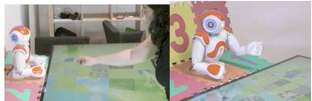
Figure 1: Nao and MT Table (left); Nao taking turn (right)

Enercities-2 is turn-based and playable by three players: two human players and an AI-equipped robot (see Figure 1 ). As the game starts, each player chooses one of three roles: Environmentalist, Economist or Mayor. Each has the same resources to spend: non-renewable resources (oil), energy and money. Oil never increases (though its decrease can be slowed), money can be earned by building or improving certain structures, and energy can be generated through power plant structures or structure upgrades. All players must build or improve structures in order to advance to the next level while maximizing a global score. There is an in-built tension between